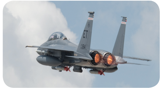
An F-15E conducts a vibration fly-around test.