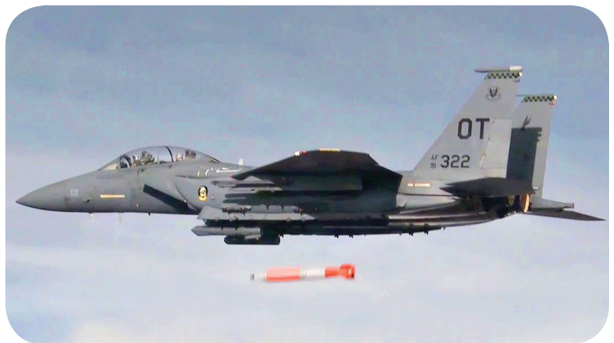
An F-15E drops a B61-12 test unit during a development flight test.

The B61-12 LEP is critical to sustaining the nation's strategic and non-strategic air-delivered nuclear deterrent capability. The B61-12 first production unit will occur in FY 2020. The bomb will be approximately 12 feet long and weigh approximately 825 pounds. The bomb will be air-delivered in either ballistic gravity or guided drop modes, and is being certified for delivery on current strategic (B-2A) and dual capable aircraft (F-15E, F-16C/D & MLU, PA-200) as well as future aircraft platforms (F-35, B-21).